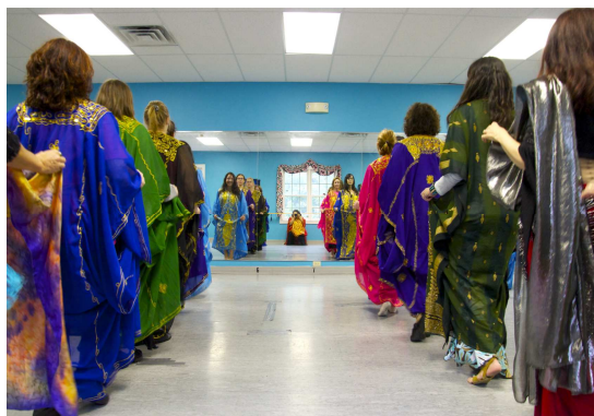
Khaleegy dance - 2010